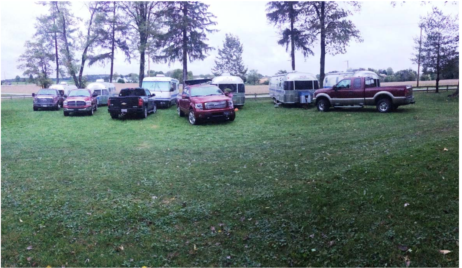
Our club parked in the campground at Sugarcreek