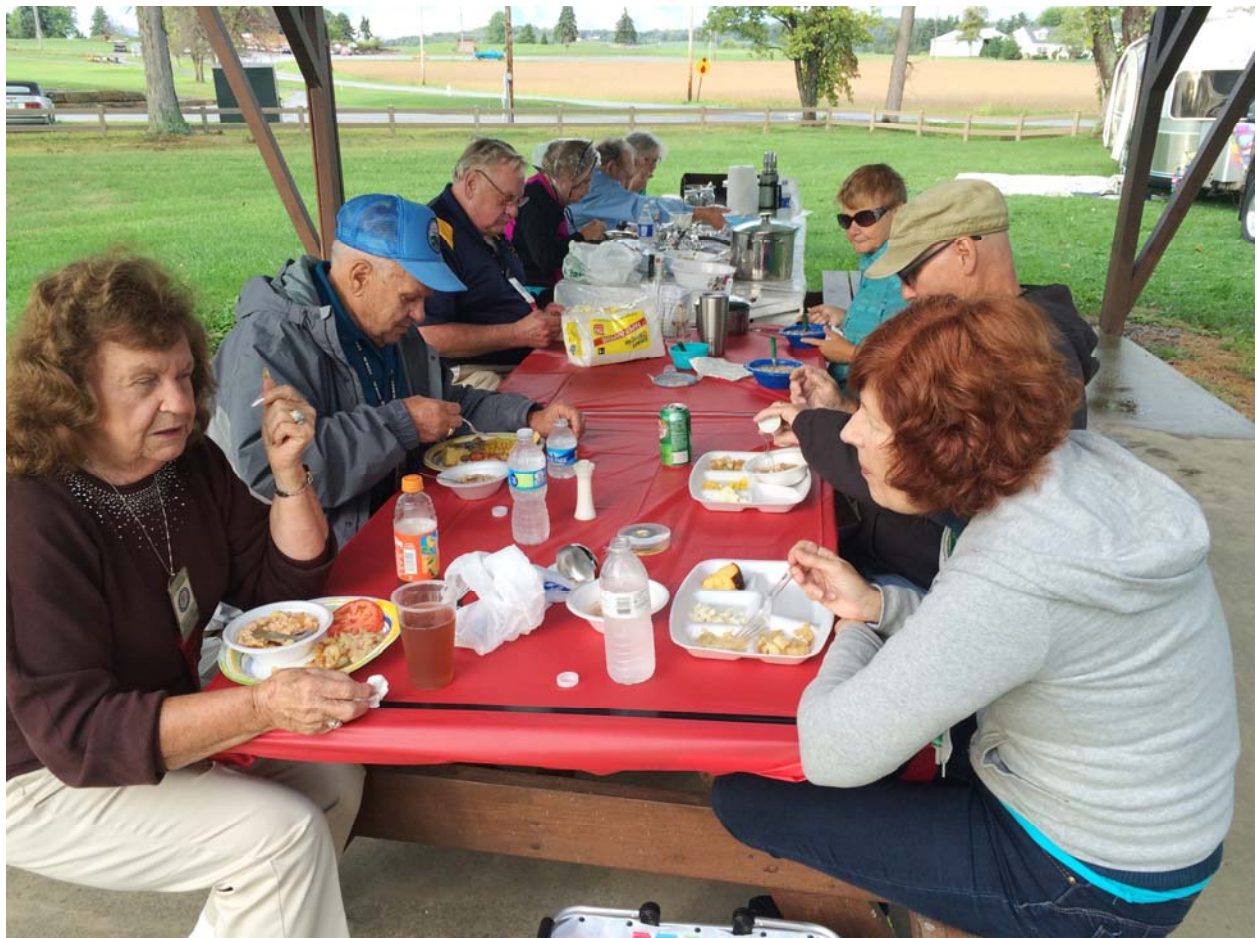
Our club having dinner under the shelter